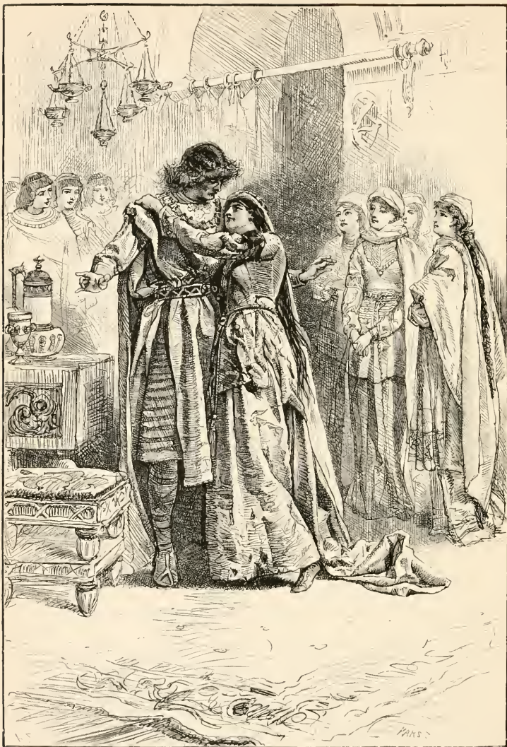
Peredur and the Maiden.